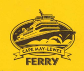
"Save Money and Time - Book On-Line!" Don't Miss The Boat - Reserve For FREE! Up to 100% reserved vehicle space