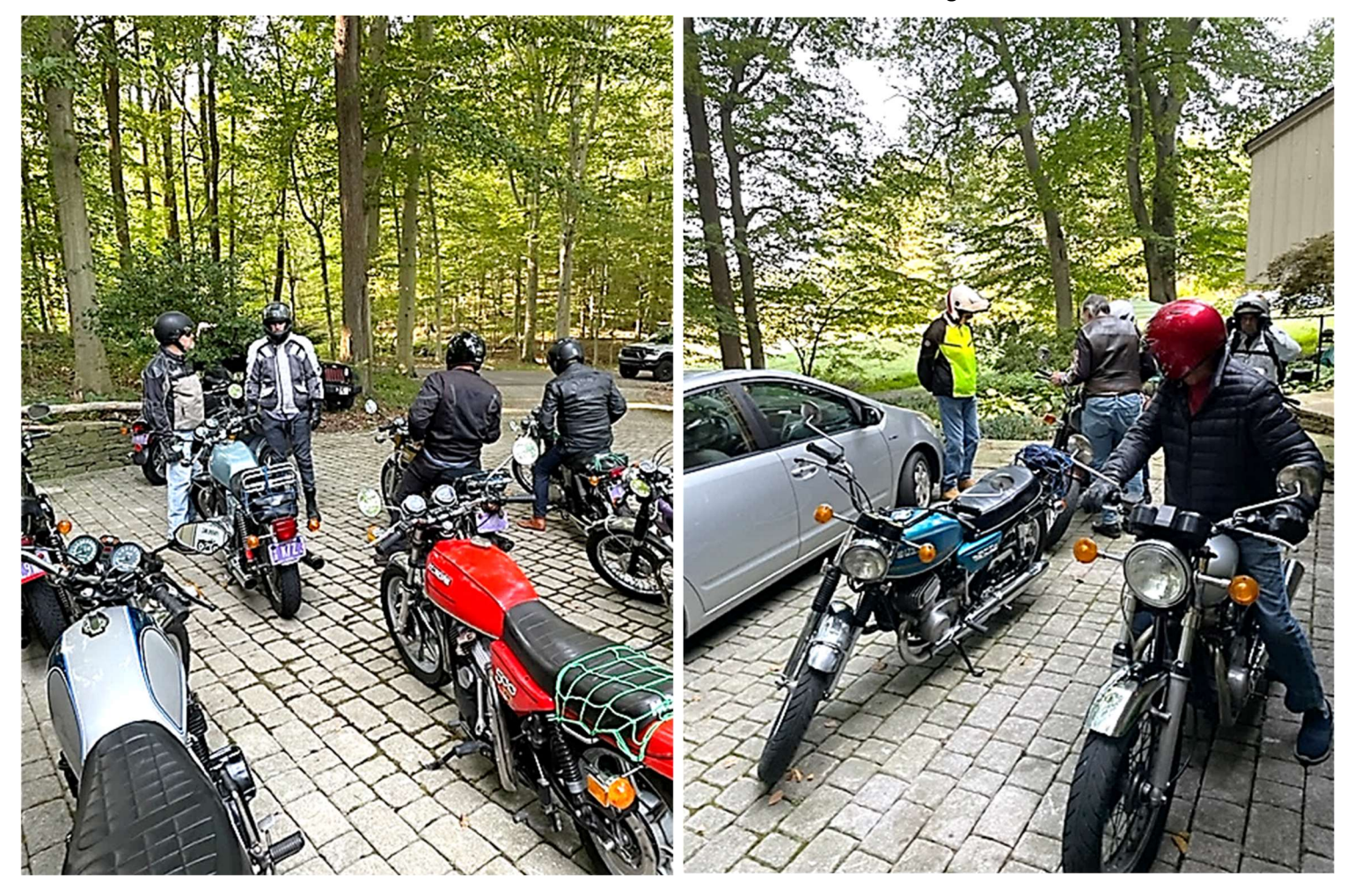
NOW BOARDING FOR OUR 9:15 AFTER BREAKFAST DEPARTURE

We used a motley international assortment of bikes, chosen according to rider requests and/or according to which bikes were due for a ride. We wound up with 4 Japanese bikes, 3 Italian bikes, 2 British bikes, and 1 each American and German. I rode the R100S/RS/EML sidecar rig, which was manufactured in The Netherlands and assembled in the USA with a German engine.