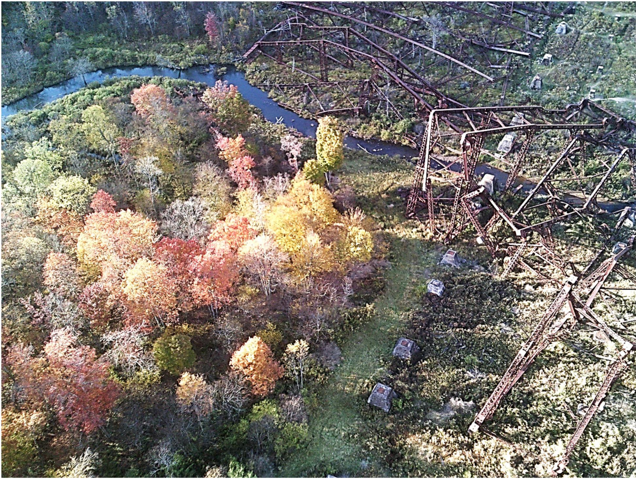
The center part of the trestle was knocked down by massive tornado. The ruins contrast with fall's finest foliage.

Dinner at the Corner Bistro, which is actually pretty busy.