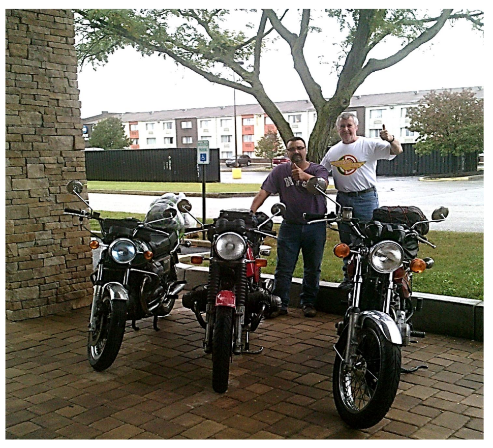
We just beat the rain into York & stayed 1 mile from the Harley factory.

Awoke around 6 a.m., and then slept fitfully until 7:45 or so. Probably anxious about the torrential rain (and wind) outside. We watch the local TV weather radar, deciding to let the worst of the storm pass before departing.