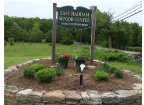
Senior Center Sign with Staehly flowers.

The East Haddam Senior Center will be hosting a town wide flea market – tag sale. Mark your calendars and stay tuned for details. Space will be available for $10.00....tables will not be provided. Contact the Senior Center for information: 860-873-5034. The usual summer menu fare will be offered for purchase. Heritage Park, Saturday, August 16 th , 8 am – 2 pm.