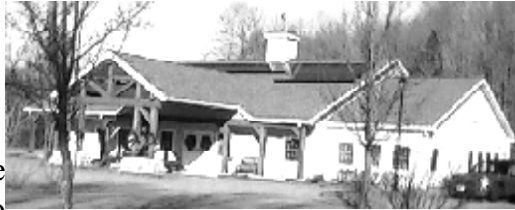
Senior Center, 15 Great Hillwood Road Moodus, CT 06469

We'd take the rowboat out fishing some, using helgramites for bait. Uncle Bob, Alice's husband, loved to go before dawn. We'd have the lake to ourselves, the surrounding hills an