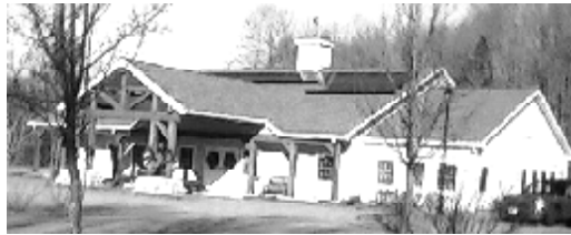
Senior Center, 15 Great Hillwood Road Moodus, CT 06469

Grades 1-5 I walked to the Hadlyme North School on Town St. by