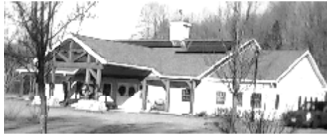
Senior Center, 15 Great Hillwood Road Moodus, CT 06469