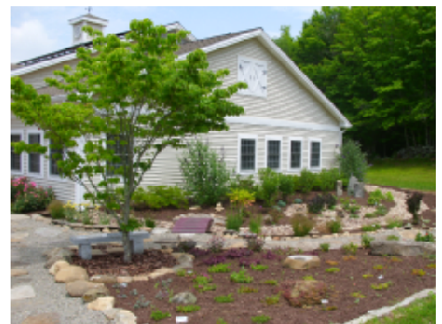
Lee May Memorial Garden...is done! Come visit the Center & enjoy our beautiful garden.

It will be sad to see summer go, but at least Sept. brings the BIG E! Wed, Sept. 23 , which is Connecticut Day . Bus will depart the Center at 8:30 am; will leave the fair at 3pm. $12 Admission fee. $5 for bus. Sign up/pay by September 9.