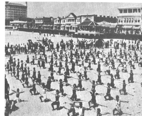
An exercise class at Ninth Street in the 1920's.