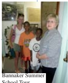
Bannaker Summer School Tour