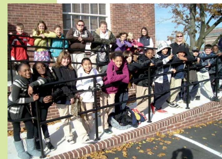
Five fifth grade classes from Mispillion School visited the Museum in the Fall and learned about early Milford history.

Keep your eyes open for upcoming games and help us to cheer and support this team!