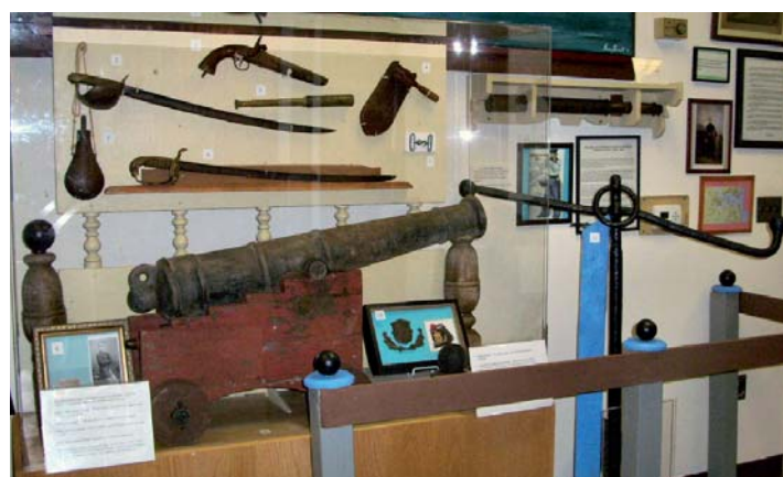
Left: A new case containing objects relating to the Naval aspect of the Civil War has been added to our exhibit recognizing the War's 150th Anniversary.