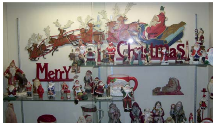
Above, left and right: Santa Claus is Coming To Town was the theme of this year's Holiday Exhibit. We were delighted to be joined by students from the First State Academy of Dance during the Holiday Stroll.