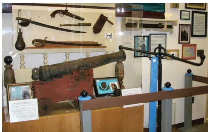
In case you haven't made it yet, you can still check out the additions to the exhibit recognizing the 150th Anniversary of the Civil War .